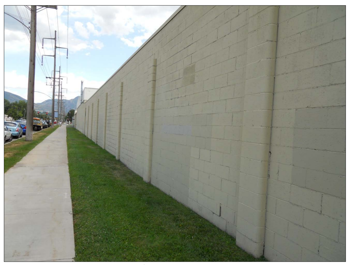
View of Property Along 800 South