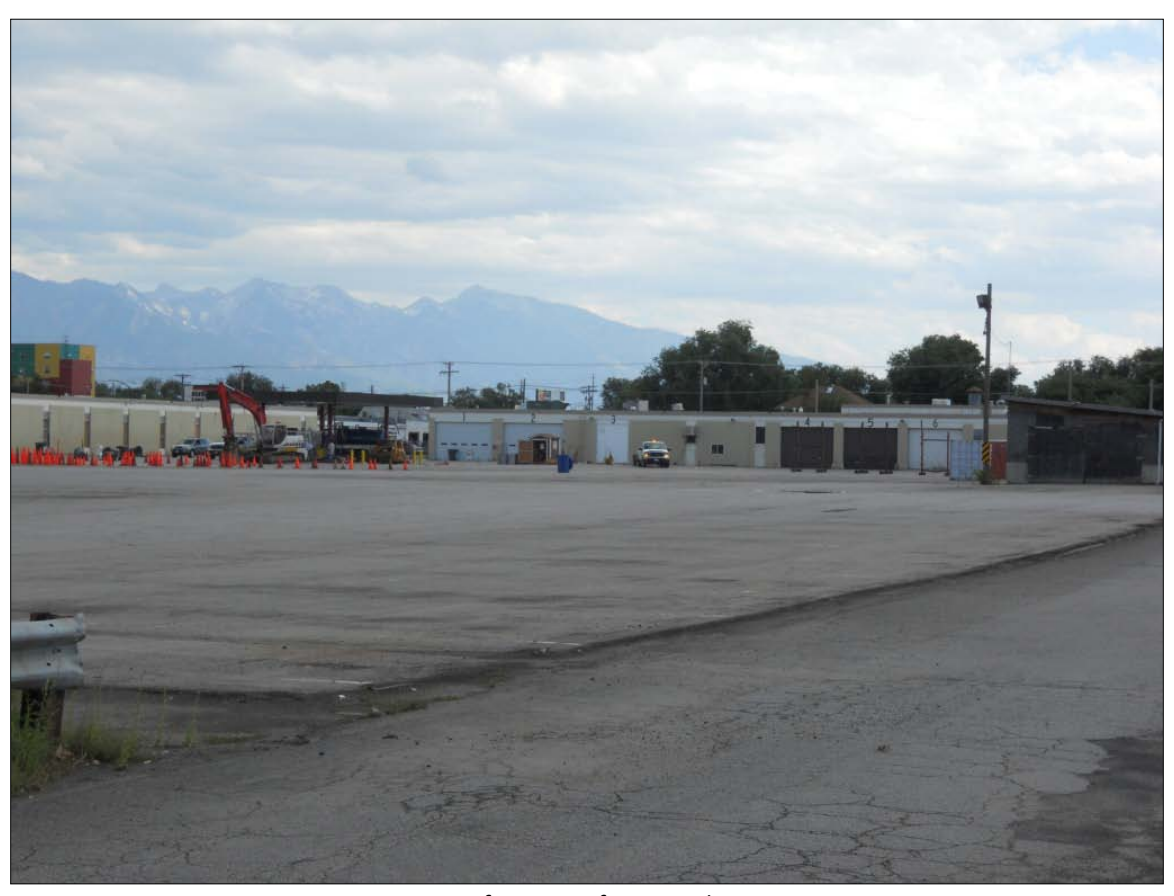
Interior View of Property from Northwest Corner