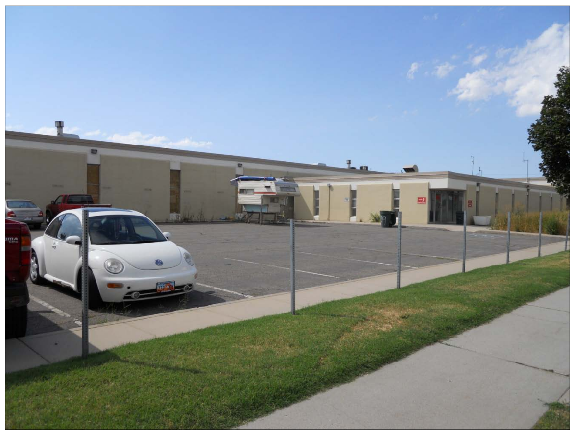
View of Property from Southeast Corner (Entrance)