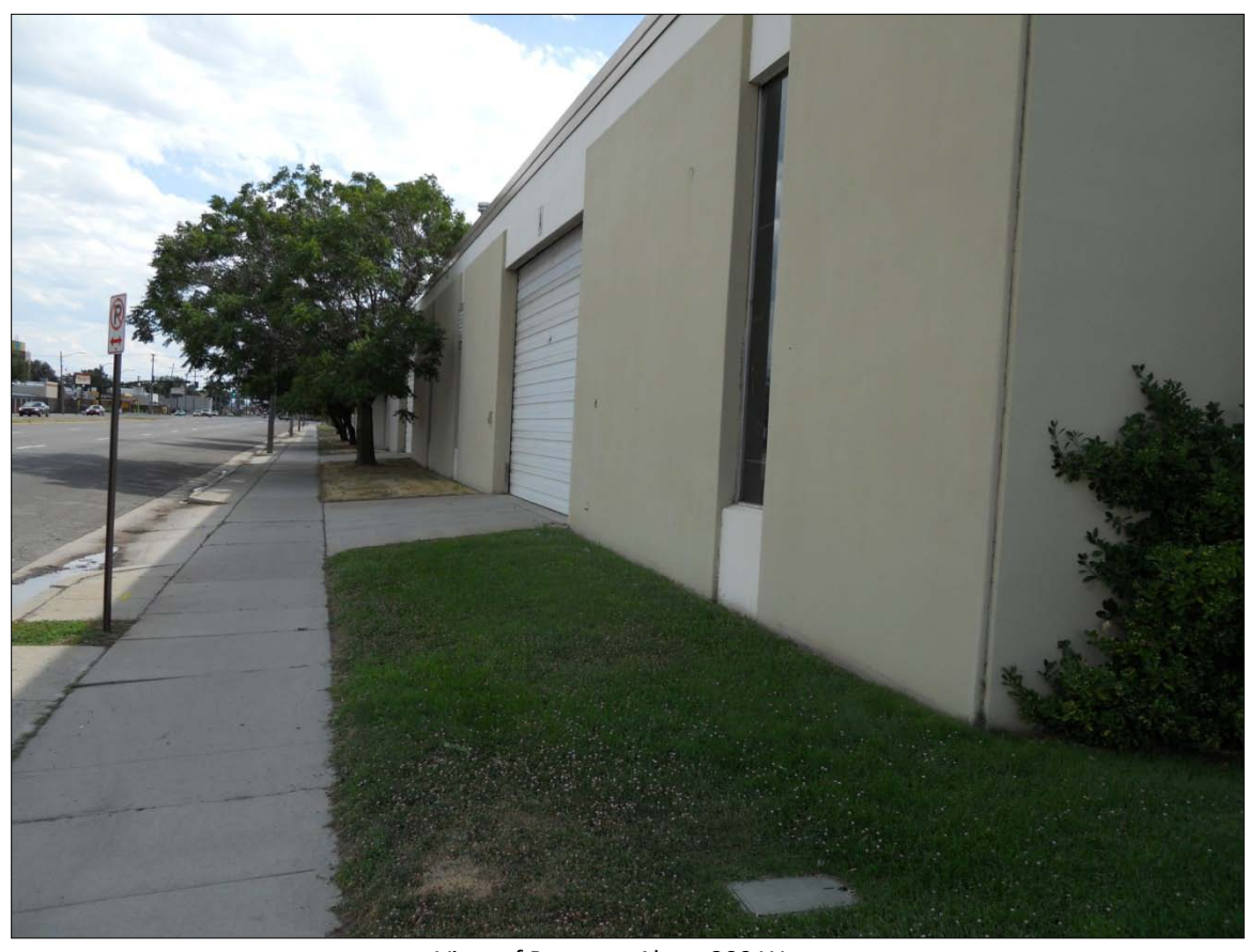
View of Property Along 300 West