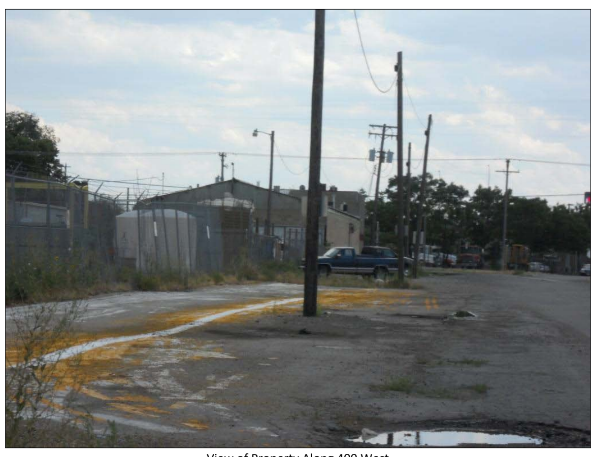
View of Property Along 400 West