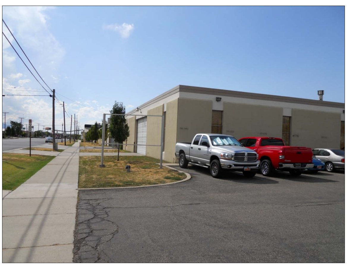
View of Property Along 900 South